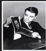
In Commemoration of DR. EDWIN HERBERT LAND 1909-1991